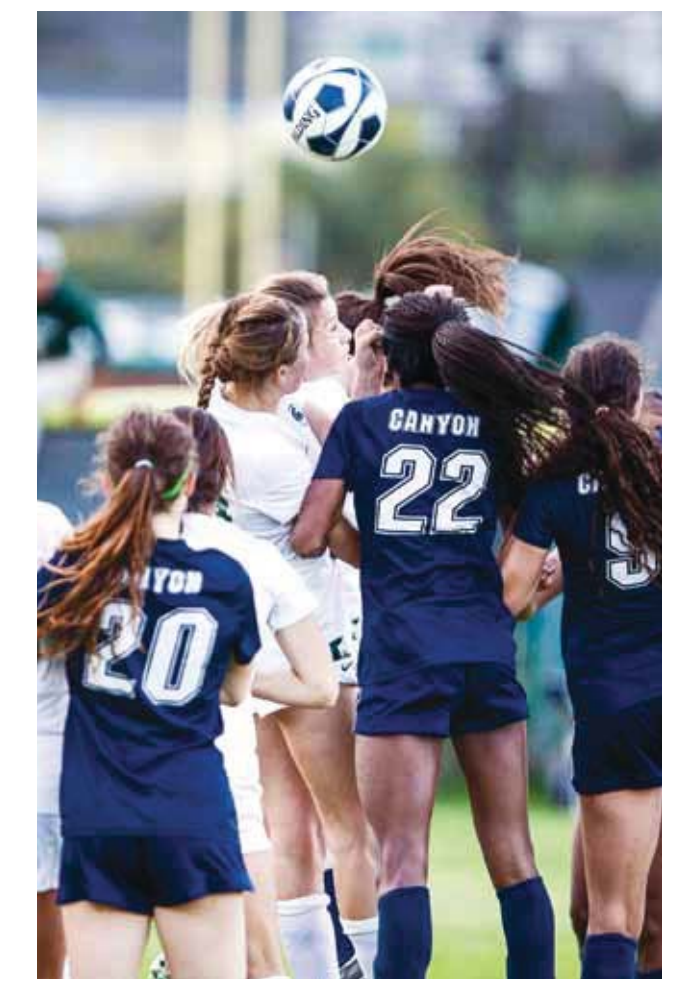
The Lady Spartans try to head the ball into Sierra Canyon's goal late in the second period of a tight tie game.